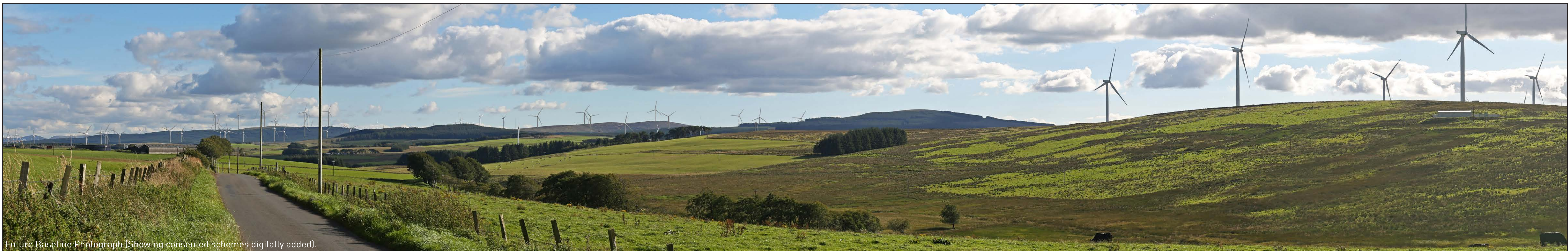
Future Baseline Photograph (Showing consented schemes digitally added).