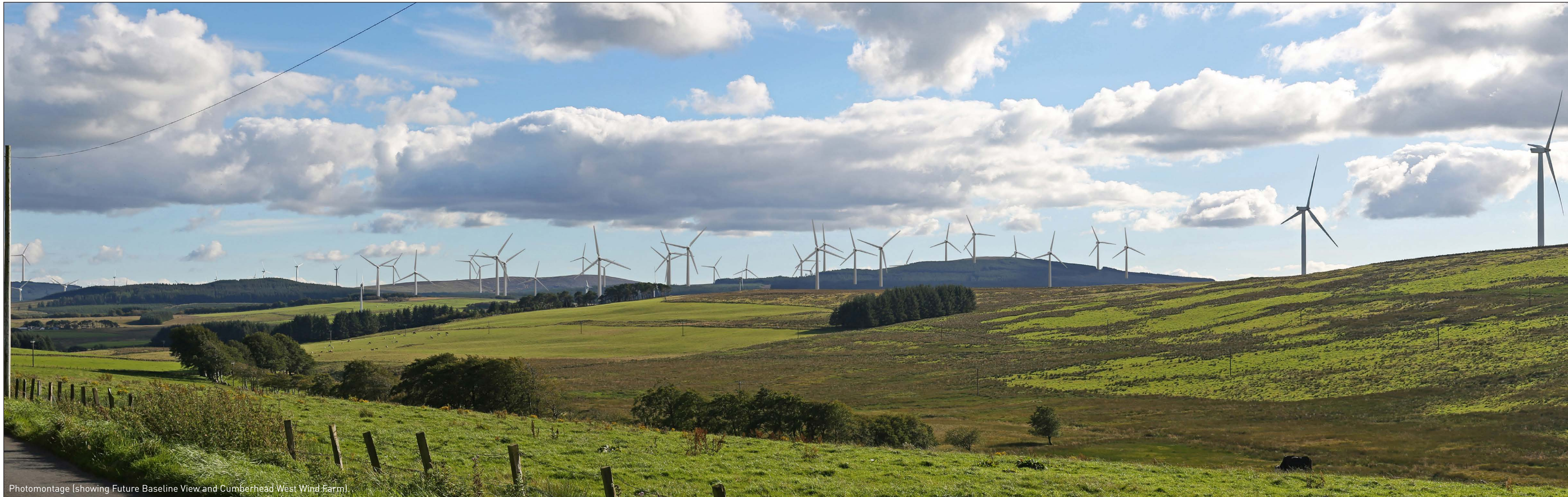
Photomontage (showing Future Baseline View and Cumberhead West Wind Farm)